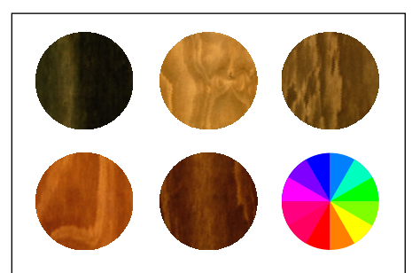
Stain Coloured stains to your desired specification & whitewash finish available