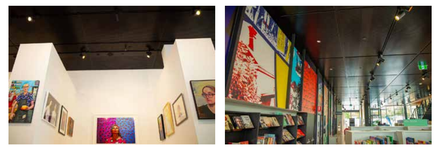
GRANT THORNTON OFFICE