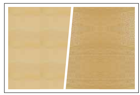
Clear Finishes are available in the following levels -10% Matt, 30% Satin