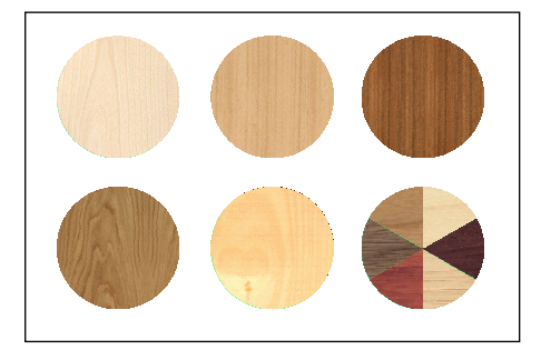
Veneers Wide range of natural timber veneers and reconstituted are available

KEY-LENA panels are excellent for feature panels and pre-finished options are popular. Can be used in their natural form with natural timber grain and textures, they can be also enhanced by applying a clear or stained finish to the face and edge of panels.