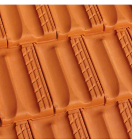
To view colour swatches for each state refer to www.monier.com.au

Create heritage style or a timeless look for your home with the classic French-inspired roof tile that has become a tradition.