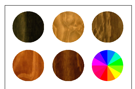
Stain Coloured stains to your desired specification & whitewash finish available